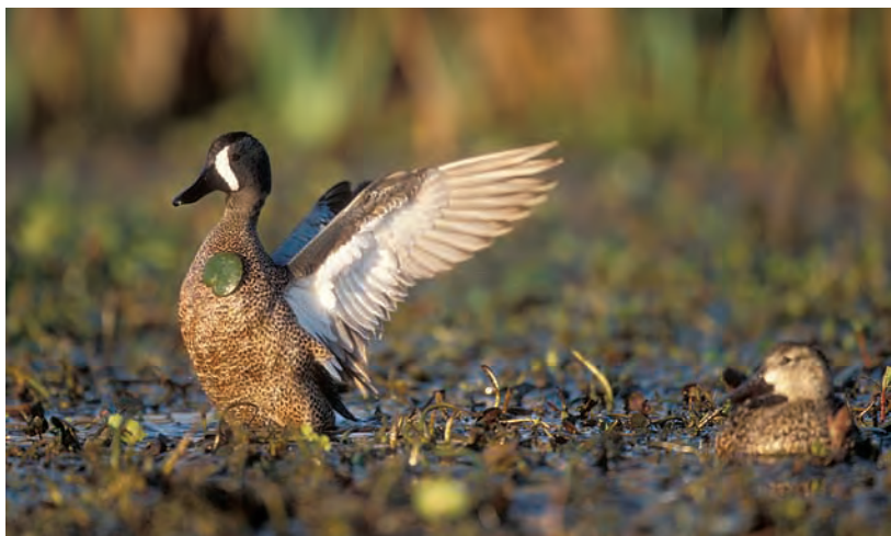
Joe Mac Hudspeth, Jr.

"By late fall, however, only standing stubble, burned and mowed paddies contained levels of waste rice above the giving-up density for feeding ducks," Kross said. "Paddies left in standing stubble contained the most waste rice at 93 pounds per acre, followed by burned at 65 pounds, mowed at 60 pounds, rolled at 45 pounds and disked paddies at 43 pounds."