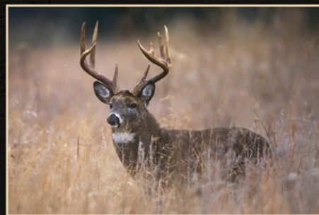
2014 Mississippi Sportsman License